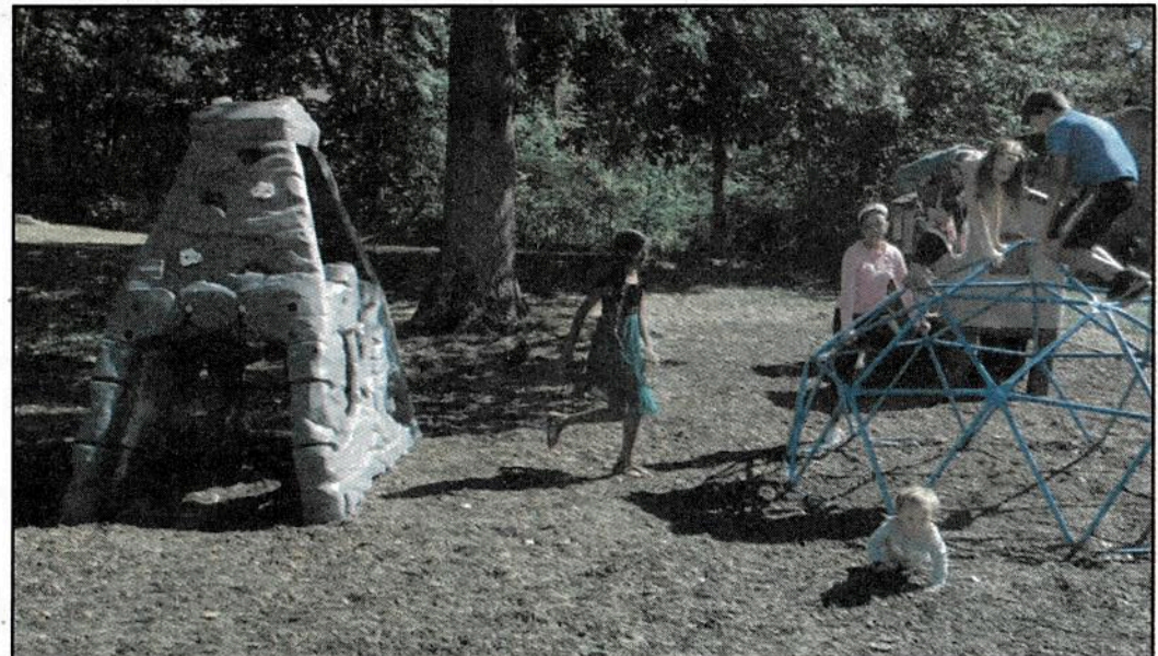
Children enjoying the newly redesigned playground.