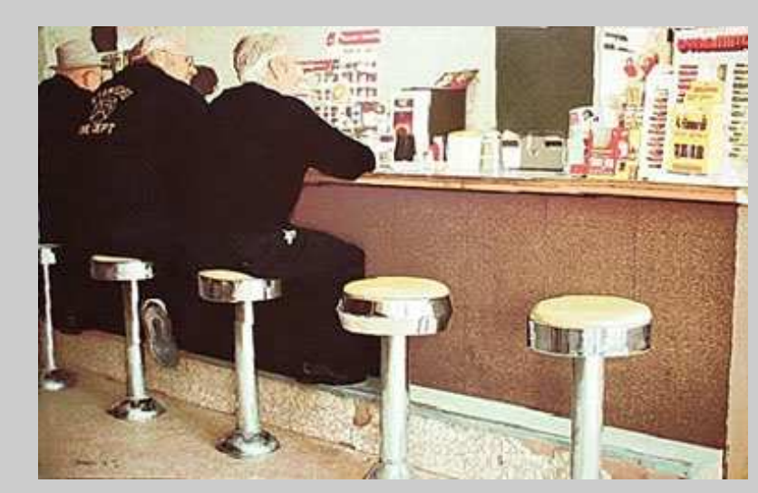
GRIDDLE INN BY RALPH GOINGS http://www.terminartors.com/artworkprofile/

As soon as you take a glance that the picture, you get the sense that there is a story behind it. Who are