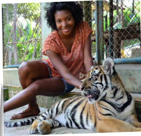
Loretta Young in THAILAND