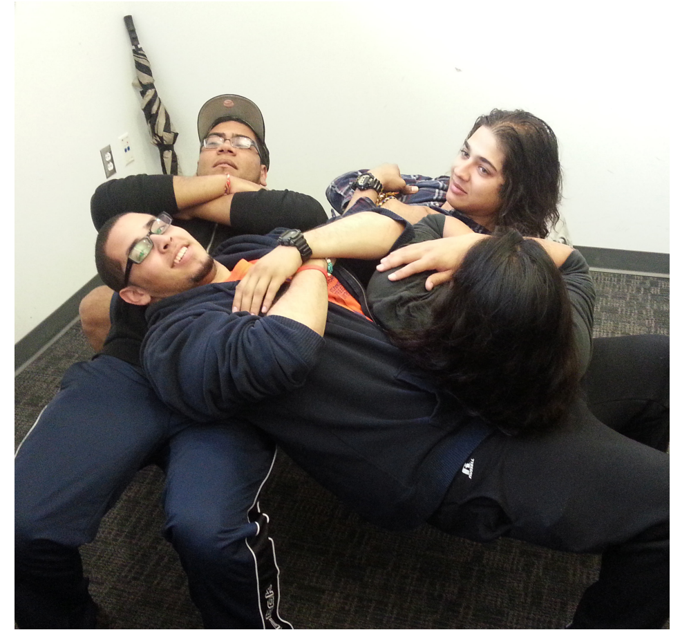
Top to bottom: Team Building; MVP Induction Ceremony 2013

The MVP Executive Board members meet individually with one of the four current program advisors for support and guidance in their roles as officers for the program and the advisors are available for personal guidance for all voting and aspiring MVP members. As MVP members become more engaged in campus and community activities they expand their network and professional support system. The program maintains its design and organization through the adherence to its constitution which was modeled after the M.A.L.E.S. program at Eastern Connecticut State University. In late fall 2012 the constitution was modified to meet the needs of our students and to fit with the structure of EOP and SUNY New Paltz, thus through extensive research and collaboration between EOP and then current students MVP was established. If you would like any further information about the program please call Robert Hancock at 845-257-3226.