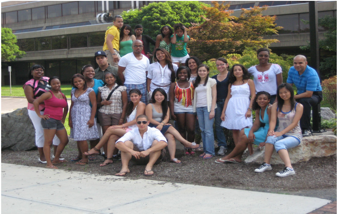
Fall 2009 Peer Mentor Staff

The Application process for Peer mentors begins in the Spring semester, so if you are a current student and interested in applying, contact your advisor for details, it is an experience of a lifetime!