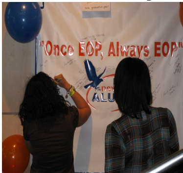
Our EOP Alumni Banner

Dating/ Healthy Relationships: How to keep a strong, healthy you AND a strong healthy relationship!