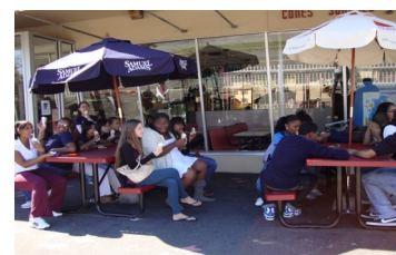
EOP students and Advisors getting Ice Cream