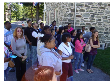
EOP Students and Advisors learning about historical Huguenot Street