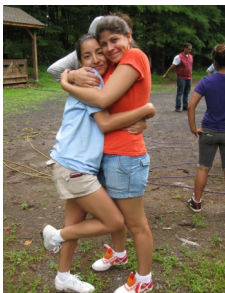
Peer Mentor Training