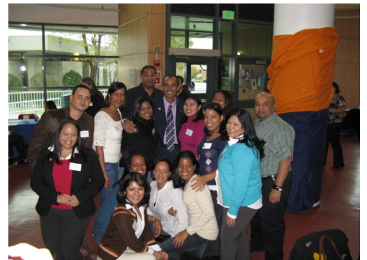
EOP Alums at the reception