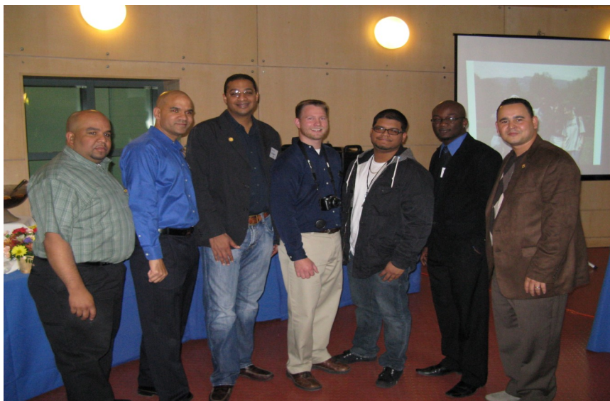
EOP Alums and Advisors at the Fall 2009 Reunion

We are looking forward to seeing you there!!