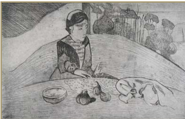
Paul Gauguin, Le femme aux figues (The Fig Woman), 1894, etching. Collection of Ken Ratner, New York