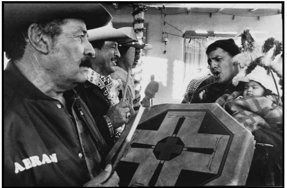
Tres generaciones cantando, 1997, gelatin silver print