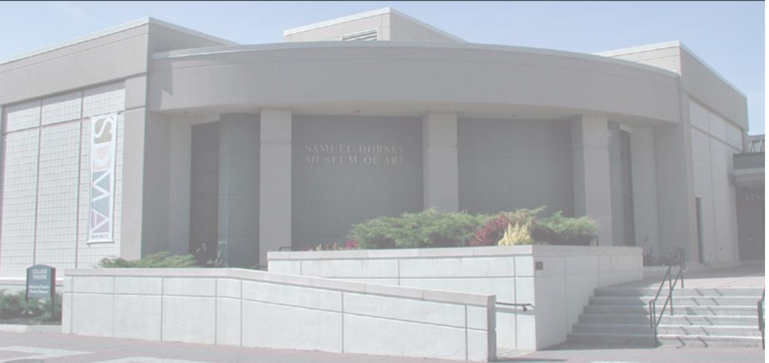
East entrance of the Samuel Dorsky Museum of Art, 2007

On July 16, 2007, Congressman Maurice Hinchey (D-NY) announced the awarding of a $150,000 grant to the Samuel Dorsky Museum of Art from the Institute of Museums and Library Services, a federal agency. Hinchey, a New Paltz alumnus (BA '68, MA '70), has maintained an ongoing interest in the SDMA and, particularly, in exhibitions featuring 19th century American painting and the historic Woodstock art colony. His advocacy on behalf of the SDMA was responsible for securing this grant from the federal government.