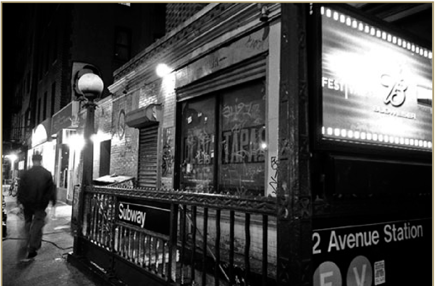
2nd Avenue Station, 2005, selenium-toned gelatin silver print