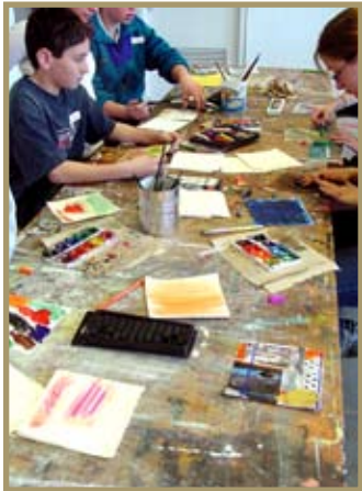
The watercolor station in the SDMA's art room.