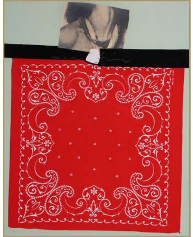
Jim Dine, Throat , 1965, screenprint. Museum Purchase, 1966.010.002

Selected works from the SDMA's collections highlight significant art historical movements, such as German Expressionism, Social Realism, and Pop Art, among others, as well as aspects of the World collection. On view are paintings, prints, sculpture, devotional and functional objects, photographs, and other works that are installed in a manner that provides multiple perspectives on the objects and on the museum's function in contextualizing them. The upcoming Reading Objects 2008 , the next in the exhibition series by the same name, will comprise 15 works selected from Re-Viewing the Museum that will be accompanied by written responses to these works by members of the campus and the larger community.