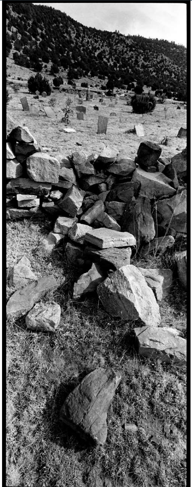
Valle de San Agustín, 2006, gelatin silver print

This exhibition is presented in conjunction with the community-wide reading project The Big Read, formerly known as One Book, One New Paltz, which focuses this year on Bless Me, Ultima by Rudolfo A. Anaya, a 1972 novel set in 1940s New Mexico.