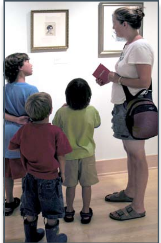
A mother and her children during Family Days at the SDMA.