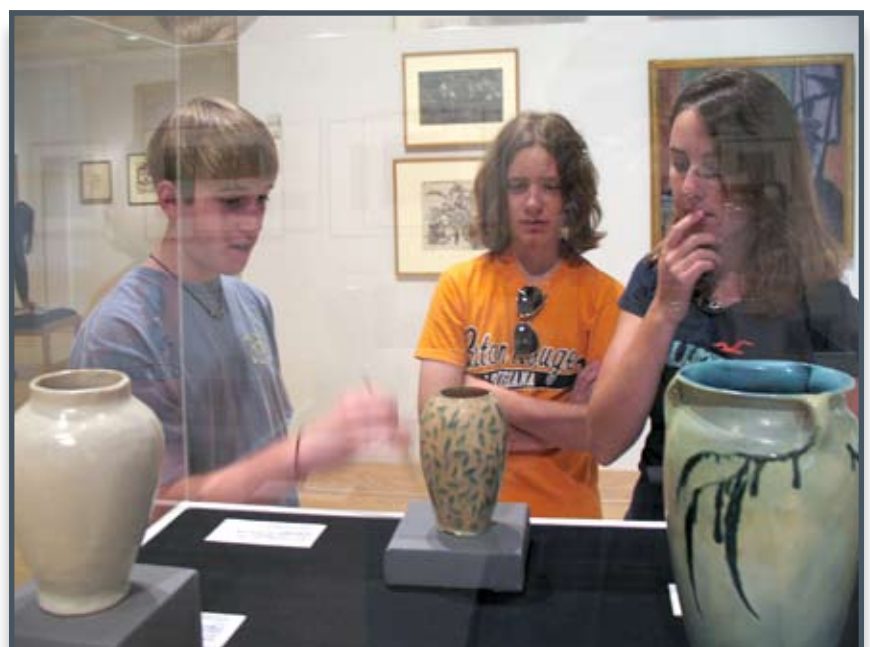
The New York State Museum Camp visits the SDMA.