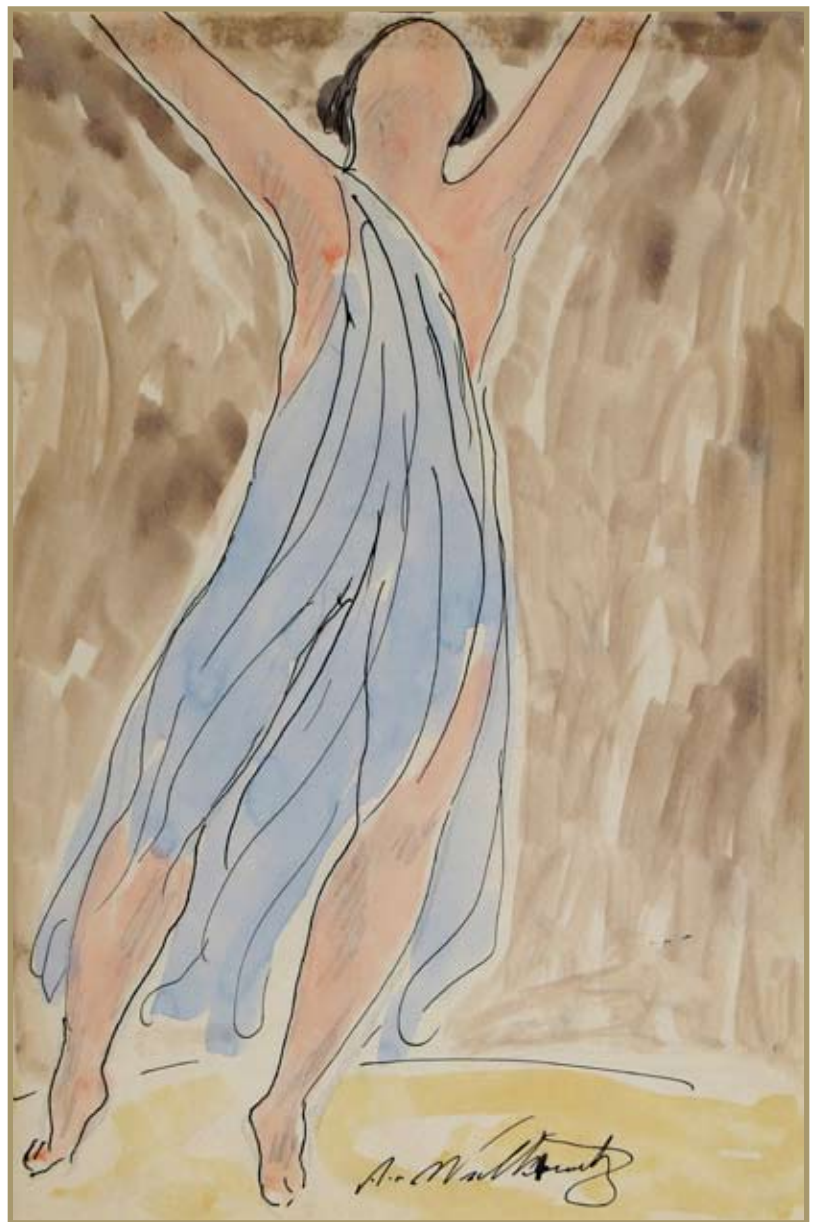
Abraham Walkowitz, Isadora Duncan , n.d., watercolor, ink, pencil on paper. Gift of the Whitney Museum of American Art, 1957.003.002

Born in Russia in 1878, Walkowitz came to the United States as a child and studied both at the National Academy of Design in New York City and at the Académie Julian in Paris. He is considered to be one of the earliest American experimenters with abstraction and was a frequent exhibitor at Alfred Steiglitz's gallery "291". Throughout his career, he exhibited both his works on paper and paintings at various museums and galleries in the United States. His work also appeared in every landmark exhibition of artistic freedom launched during the early 20th century, including the 1913 Armory Show, the Forum Exhibition of 1916, the People's Art Guild shows of contemporary art from 1915-1917, and the inaugural show of the Société Anonyme in 1920. He died legally blind at the age of 86 in his Brooklyn studio in 1965.