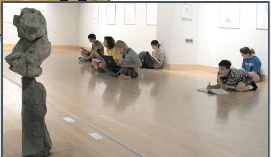
(Right) Students prepare an assignment at the exhibition George Quasha: "art is" and Axial works in stone, graphite, and video.