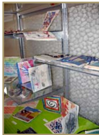
My Poetic Landscape student artists books on view at the Elting Memorial Library in New Paltz.