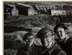
W. Eugene Smith, Untitled (coal miners, England), ca. 1955, gelatin silver print. On extended loan, Floating Foundation of Photography