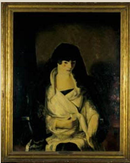
George Bellow, Roumanian Girl (1957.1.1), before restoration

One thing that all conservators keep in mind when working on any art object is that all treatments must be reversible. This is a critical factor because in the future, a better and more efficient method of restoration might be available, and having the ability to easily remove past treatments is critical to extending the object's life, and to keeping these creations available for all to enjoy for years to come.