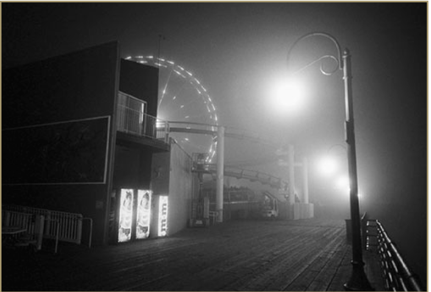
Santa Monica Pier, Fog 2, 2002, selenium-toned gelatin silver print