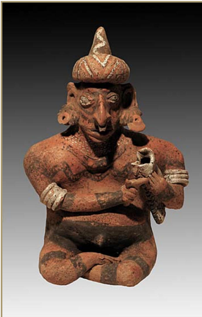
Seated Musician, 300 BC-300 AD, from western Mexico, painted terracotta. Museum Purchase, 1965.020.001