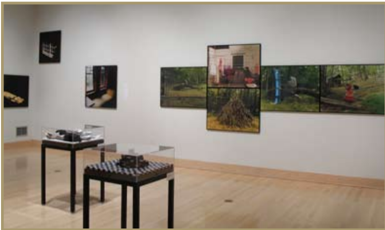
Installation View, Interpreting Utopia