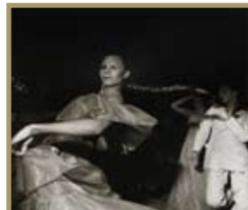
Larry Fink, Dance , ca. 1990, gelatin silver print. On extended loan from the Center for Photography at Woodstock, Gift of the Artist