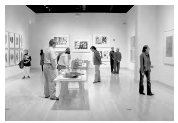
View into the Sara Bedrick Gallery during the opening for Rimer Cardillo: Impressions (and other images of memory)