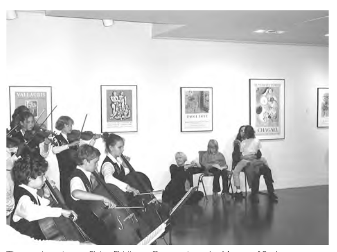
The youth orchestra Flying Fiddlers offers music at the Master of Business Administration Alumni Reception held at the SDMA in October.