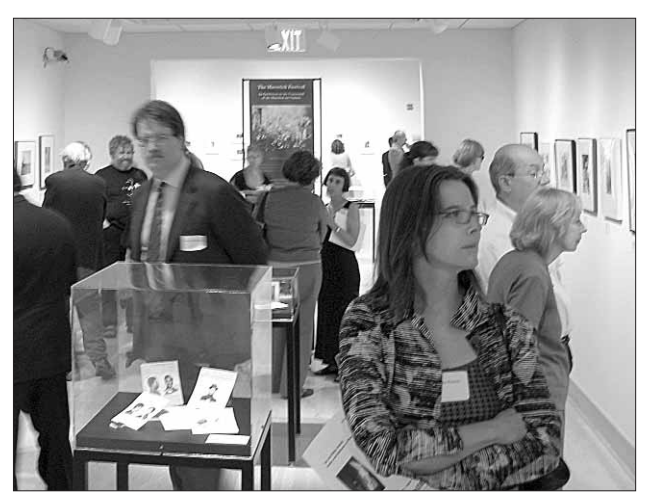
Visitors to the SDMA at the opening of the exhibitions The Material Image: Surface and Substance in Photography and The Maverick Festival: An Exhibition on the Centennial of the Maverick Art Colony.