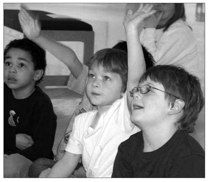
Children from the Children's Center on campus are awestruck by Don Nice's imaginative and colorful paintings in the exhibition Don Nice:The Nature of Art.