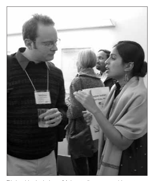
Distinguished scholars of Asian studies compare ideas at the reception for the New York Conference on Asian Studies held at the SDMA.