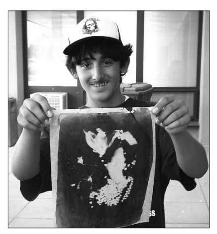
A proud student holds up a cyanotype.

The SDMA continues to offer a rich variety of educational programs both for school groups and for the general public. Over 1,000 students and adults participated in the SDMA's engaging and informative programs. Aside from public lectures, curator's talks, docent talks, school visits, demonstrations, and workshops, this year saw the introduction of two new public programs. The first, called Studio Visits, was initiated in March and focuses on an artist in the working environment of the studio in order to illuminate aspects of the creative process. In conjunction with the exhibition Don Nice: The Nature of Art, the artist Don Nice opened his studio to a group of very enthusiastic visitors from the SDMA, showing them sketches from his travels and other preparatory sketches relating to his work.