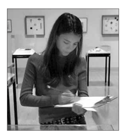
A student from New Paltz High School completes a project for her Creative Crafts class at the metals exhibition Juxtapositions : Selections from the Metals Collection.