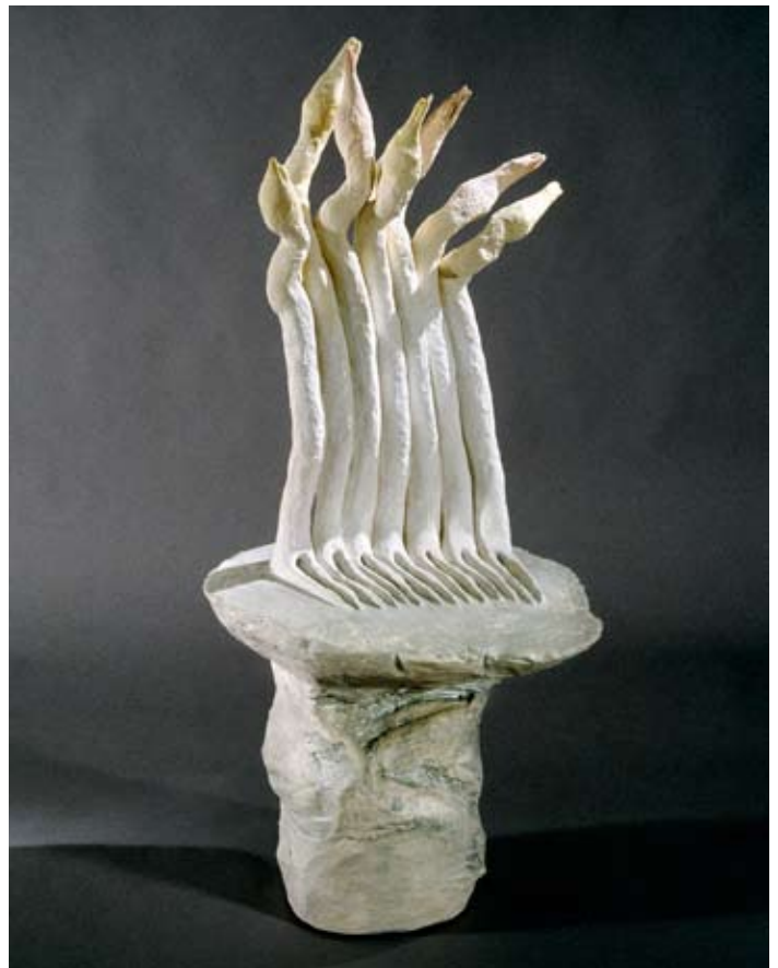
Scholars' Garden VIII (multiple forms with feet on rock face), 2003.