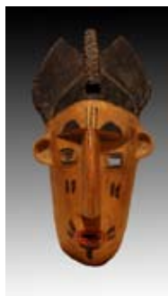
African Art in the Samuel Dorsky Museum of Art www.newpaltz.edu/museum/exhibitions/african_art/index.htm