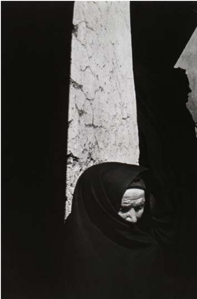
W. Eugene Smith, Untitled (from the Spanish Village series) , 1951, gelatin silverprint. Art Committee Purchase, 1960.005

While the Samuel Dorsky Museum of Art is fortunate to own eight black and white photographs by legendary American photojournalist W. Eugene Smith, it is even more fortunate that in this collection there is an iconic image of an old peasant woman emerging from the shadows which is from the photographer's most famous photo essay known as "Spanish Village." Published by Life magazine in its April 9, 1951 issue, this essay brought to the American coffee table a glimpse of a foreign culture that had been bypassed by the technological advances of the 20th century.