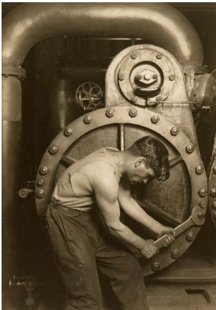
Lewis Hine, Powerhouse Mechanic , 1920, gelatin silver print. Courtesy Howard Greenberg

When seen as a whole, the photographs in the 25th anniversary exhibition serve as a memoir; each image traces a chapter in Greenberg’s life as a collector. Although not all of the pictures would be considered obvious choices, they are connected, explains Greenberg, by “a unity of craft and vision, as well as by their compelling personal meaning.” The exhibition comprises iconic images such as W. Eugene Smith’s powerful documentation of Welsh coal miners and Ruth Orkin’s universally beloved American Girl in Italy . In addition, the show will highlight lesser know works including Leon Levensteins’s graphically charged Handball Players and the Czech photographer Frantisek Dritikol’s avant-garde construction of light and shadows. But despite their diversity, the works are unified not only because they belong to Greenberg but also because they are reflective of the qualities that have come to define the aesthetics of his gallery.