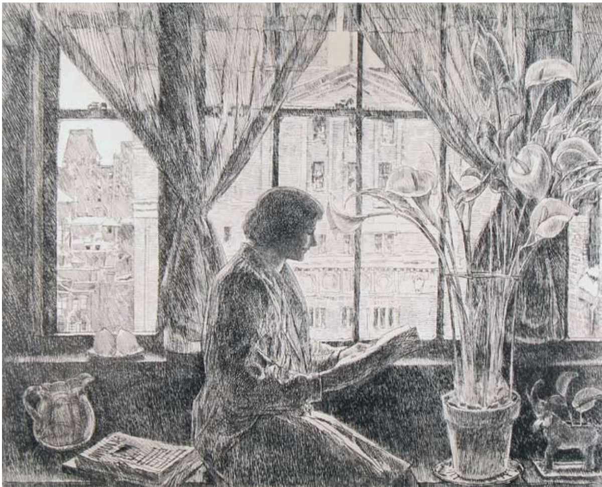
Frederick Childe Hassam, Virginia and a New York Winter Window , 1934, etching on paper. 1957.001.069