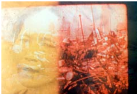
Carolee Schneemann, Viet-Flakes , 1965, DVD transferred from toned black and white 16 mm film.