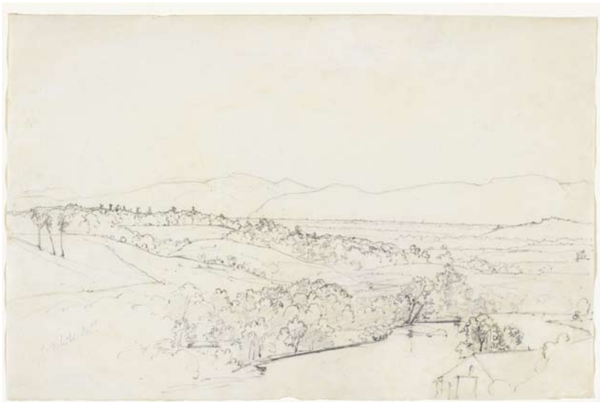
John Frederick Kensett, Cattskill [sic] Mt. , ca. 1849, graphite on paper. Courtesy Dia Art Foundation, on extended loan to The Frances Lehman Loeb Art Center, 80.296