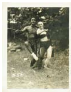
The Maverick Festival www.newpaltz.edu/museum/exhibitions/maverick2007/index.htm