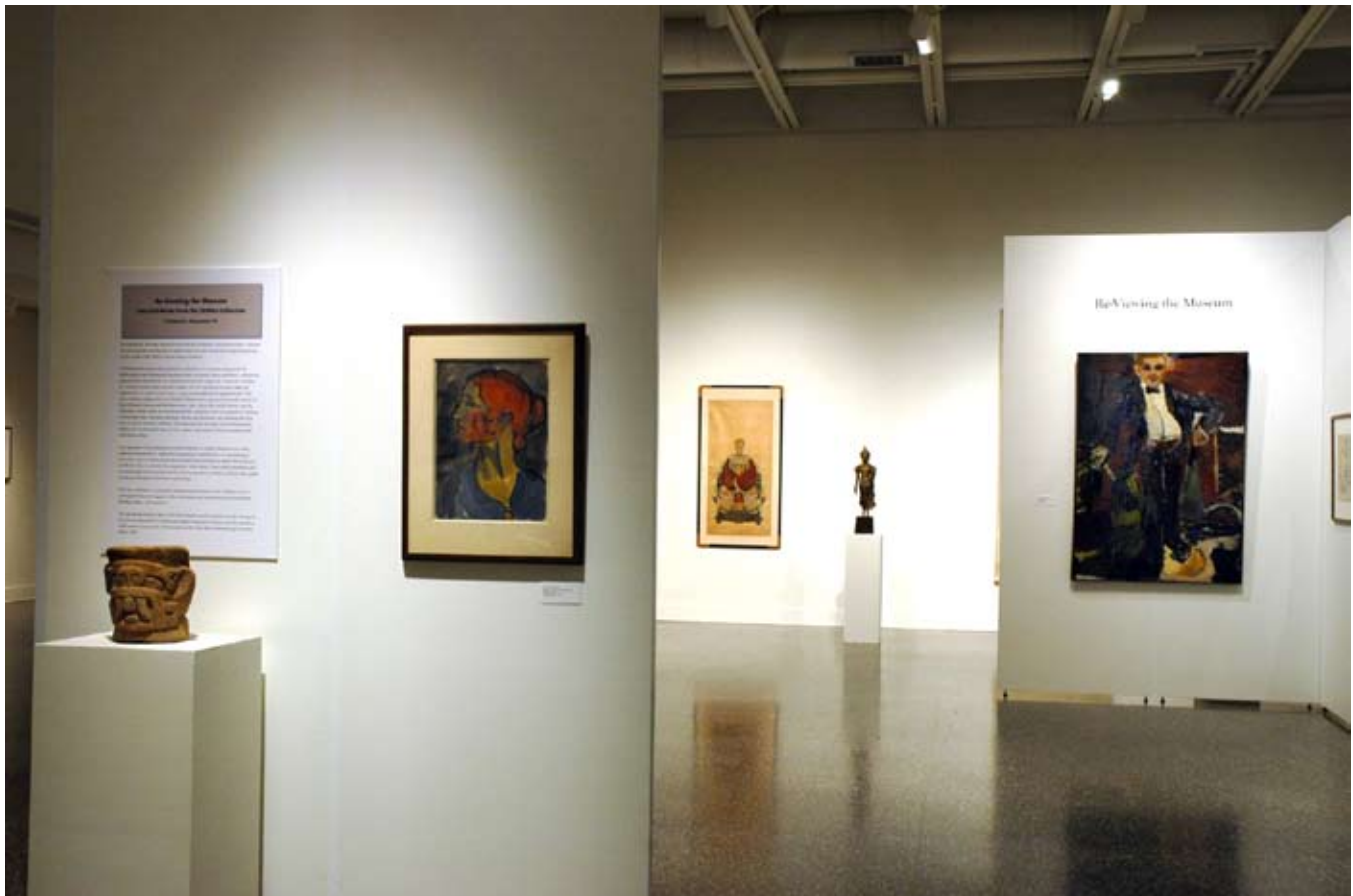
View into Re-Viewing the Museum , the exhibition at the SDMA from which works were chosen for Reading Objects 2008.

The exhibition is being held in the Sara Bedrick Gallery.