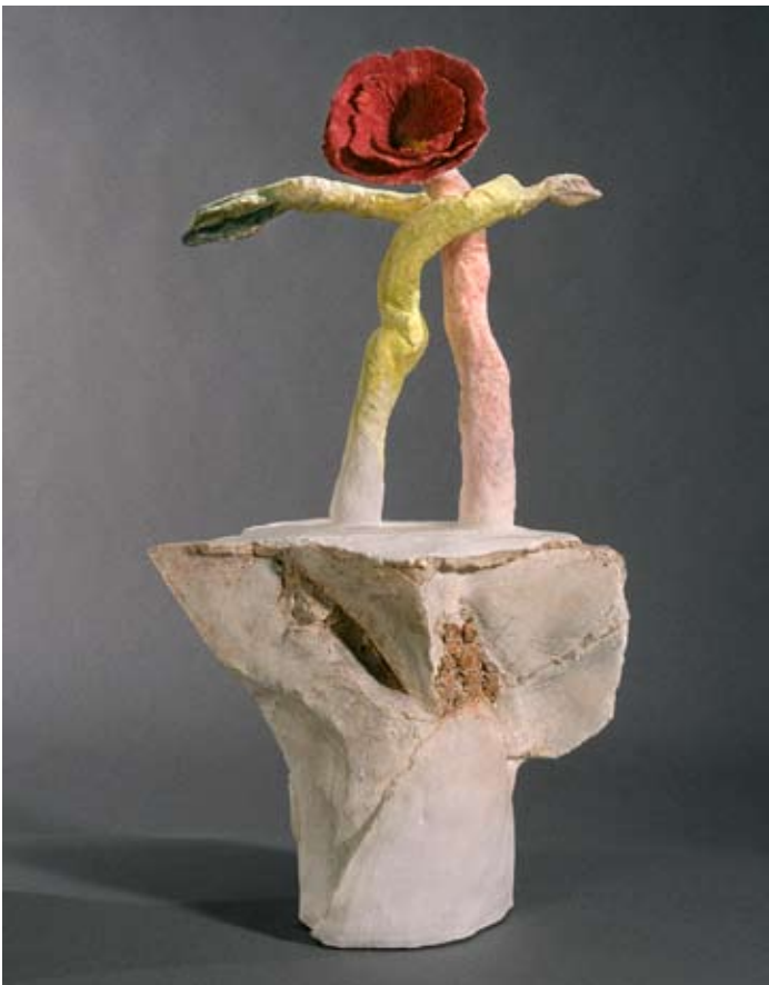
Scholars' Garden VI (pink/red flower with green snake out of rock), 2003.