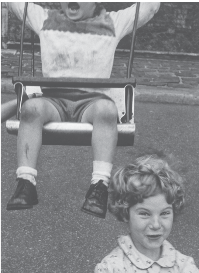
William Klein, Boy on Swing + Smirking Girl, New York, 1955, gelatin silver print; printed later.