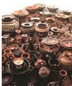
Provenience Unknown! Illegal Excavations Destroy the Archaeological Heritage www.newpaltz.edu/museum/exhibitions/online.html