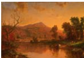
American Scenery: Different Views in Hudson River School Painting www.newpaltz.edu/museum/exhibitions/americanscenery/index.htm