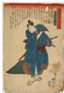
Asian Art in the Samuel Dorsky Museum of Art www.newpaltz.edu/museum/exhibitions/asianart/